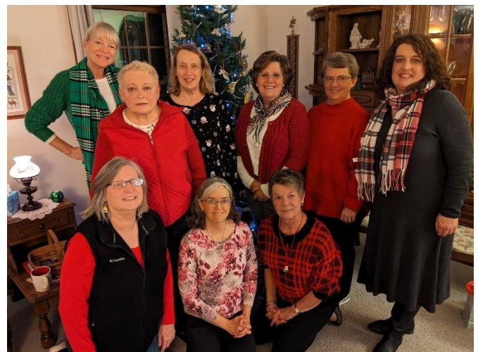
Sarah Circle women celebrate Christmas 2023